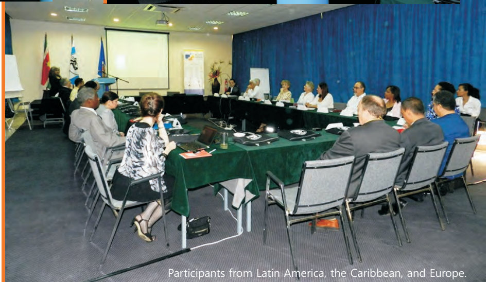
Participants from Latin America, the Caribbean, and Europe.