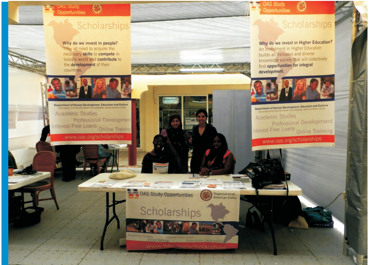
OAS Scholarships Booth (Department of Human Development, Education and Culture)

International agencies and local companies, academic institutions and other technology related enterprises showcased initiatives related to innovation and technology in education.